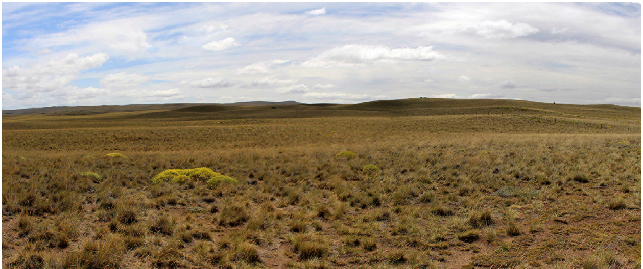
Figure 3. Native Patagonian steppe. Habitat in which Liolaemus kingii was found in Villa La Tapera, Aysén Region, Chile.