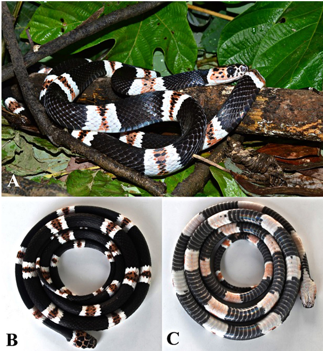
Figure 1. Adult male Rhinobothryum lentiginosum (CIRA-823) collected in Bolivia, Department Pando, Province Abuná. A. Live photograph. B. dorsal view. C. ventral view.

Two anterior temporal scales and two posterior temporal scales. Ventral scales = 263, divided cloacal scale, divided subcaudal scales = 106. Large eye with vertically elliptical pupil.