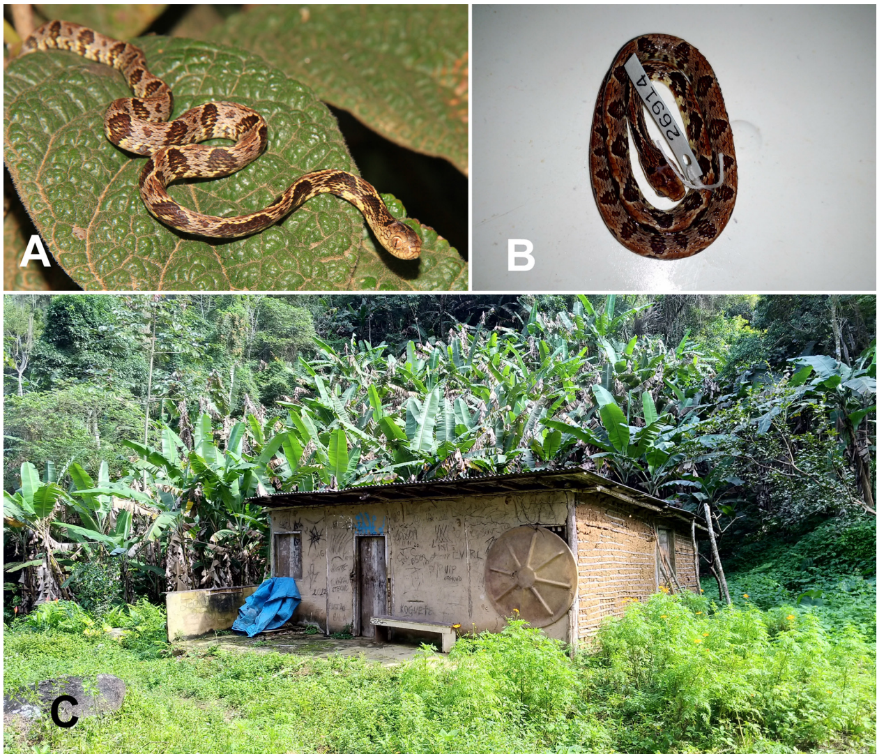
Figure 1. Female specimen of Dipsas variegata (Duméril, Bibron & Duméril, 1854). A. In life. B. Specimen deposited in the herpetological collection of the Museu Nacional (MNRJ 26914). C. Habitat in Pedra Branca State Park, Rio de Janeiro.

This record expanded the geographic distribution area of the species to the coast of Rio de Janeiro state (Fig. 2).