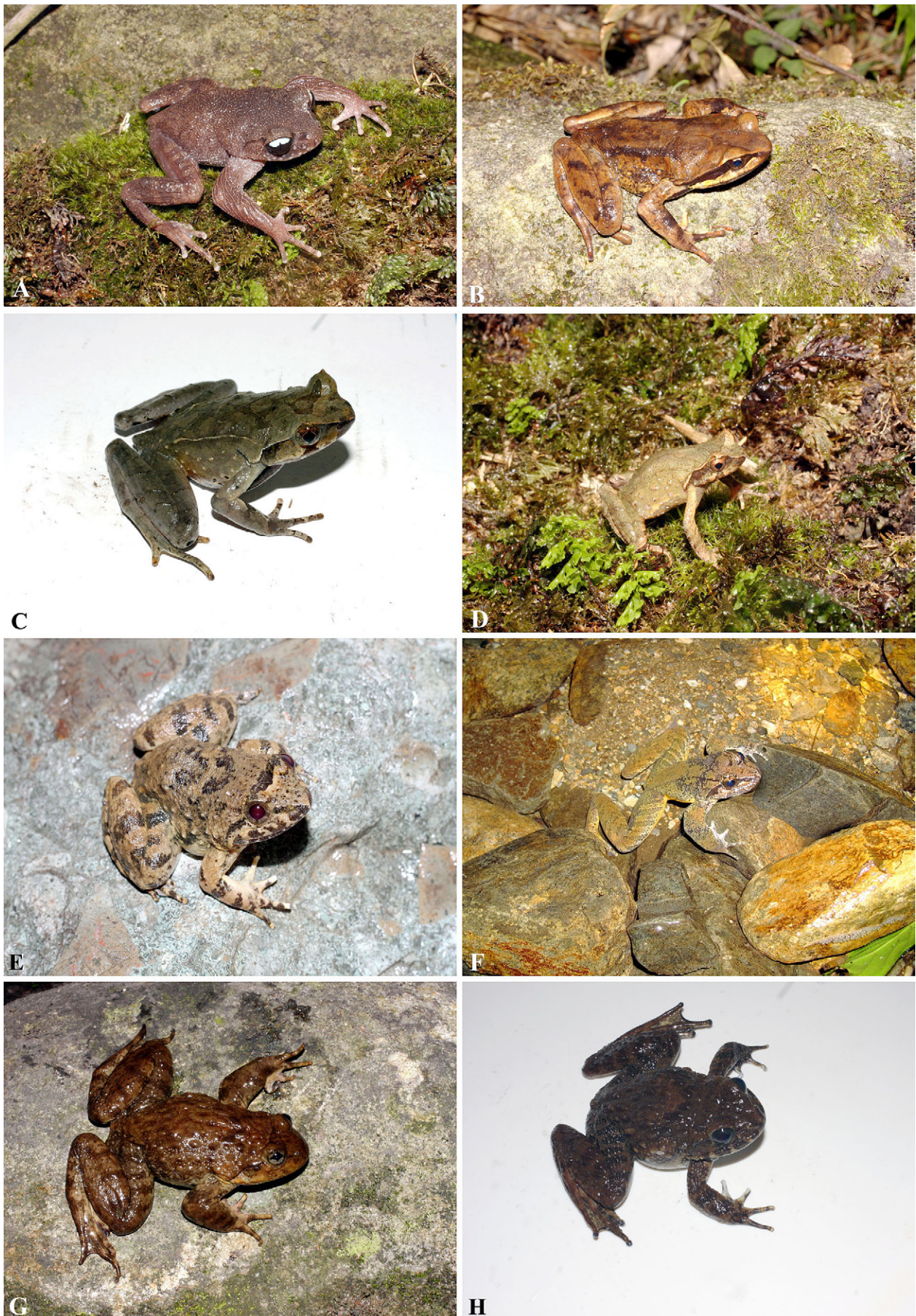
Figure 3. Amphibians from Lai Chau Province, Vietnam. A–D. Megophryidae. A. Leptobrachium ailaonicum (IEBR 4761). B. Megophrys gigantea (IEBR 4766). C. M. jingdongensis (IEBR 4770). D. M. rubrimera (IEBR 4772). E–H. Dicroglossidae. E. Limnonectes bannaensis (IEBR 4778). F. Nanorana aenea (IEBR 4786). G. N. yunnanensis (IEBR 4792). H. Quasipaa verrucospinosa (IEBR 4797).