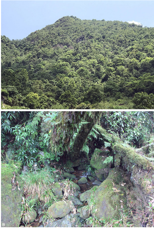
Figure 2. Habitats surveyed in Lai Chau Province, Vietnam. A. Evergreen forest. B. Microhabitat of a stream.

outer metatarsal tubercle absent; tibio-tarsal articulation reaching to the eye when leg adpressed along body. Skin: dorsal surface of head, body, and upper limbs smooth with microscopic network of ridges; flanks, belly, chest, throat, ventral forelimbs and thighs with small pustules.