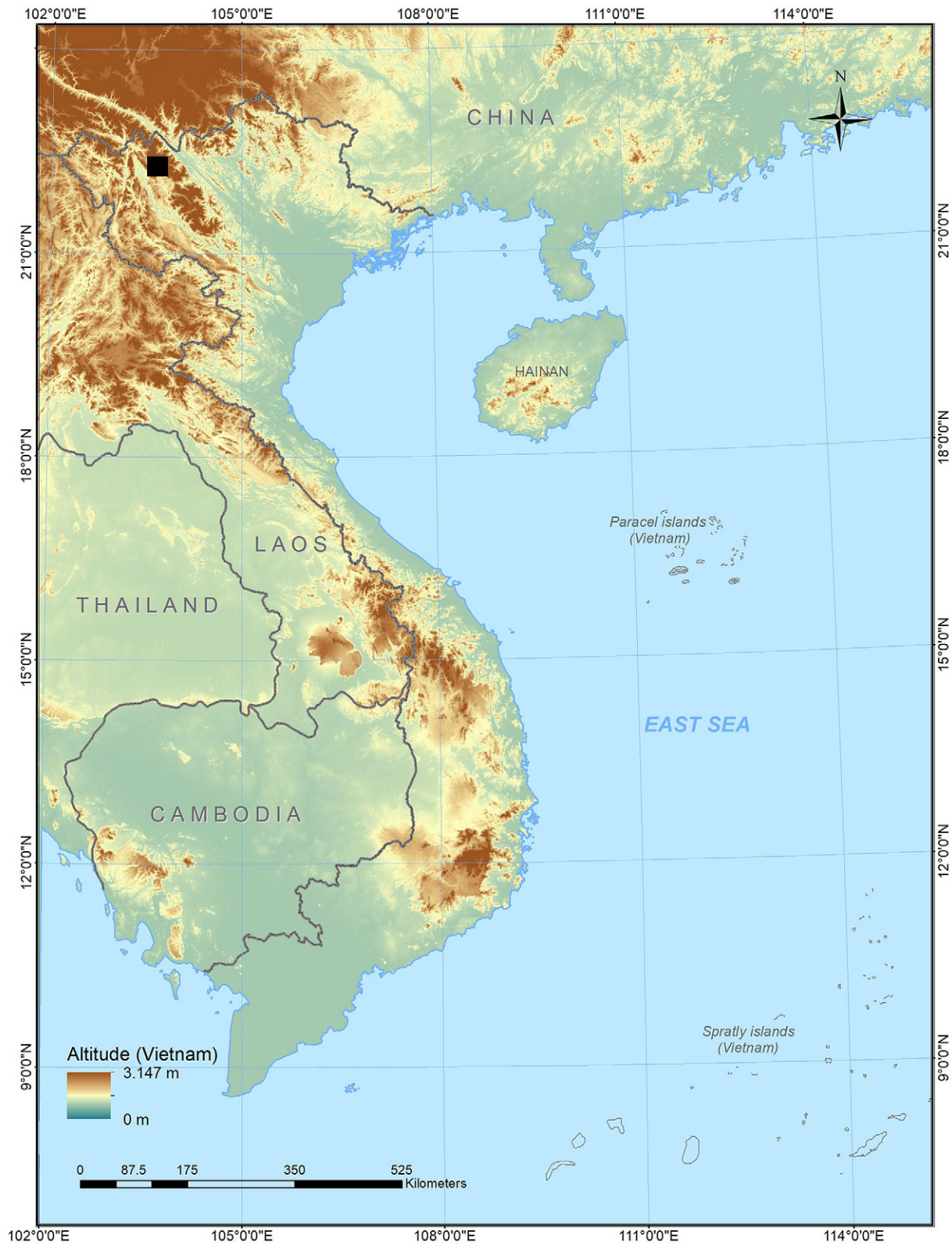
Figure 1. Map showing the sampling site in Lai Chau Province (black square), northwestern Vietnam.

canthus rostralis indistinct, eye large (ED 8.4–9.2 mm), tympanum indistinct; supratympanic fold distinct, vomerine teeth absent; tongue large, notched posteriorly; the males with 30–40 spines. Arm long (FLL 17.7–19.7 mm), relative lengths of fingers I<II<IV<III, tips of fingers swollen; fingers free of webbing, lateral fringes absent; subarticular tubercles distinct, formula 1, 2, 3, 2;