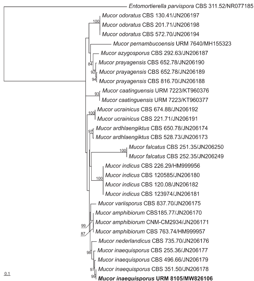
Figure 2. Phylogenetic tree of Mucor inaequisporus and related species constructed using ITS rDNA sequences. Entomortierella parvispora was used as outgroup. Sequences are labeled with their database accession numbers. Support values were obtained from maximum likelihood analysis. The sequence obtained in this study is annotated in bold. Only support values of at least 80% are shown.

Identification. Colonies golden yellow, reverse yellow, growing rapidly on MEA (9 cm diameter) after 4 days at 25 °C. Sporangiophores yellow, erect, undulating, curved and constricted next to the sporangia, with yellow droplets, simple or with long or short sympodial branches, with encrusted wall, 12–45 µm in diameter. Sporangia yellow, globose and subglobose, with a vitreous aspect, 60–170 µm in diameter, wall echinulate, deliquescent in mature sporangia and persistent in young sporangia. Columellae yellow, highly variable in shape, pyriform, some with a constriction, conic, oblong,