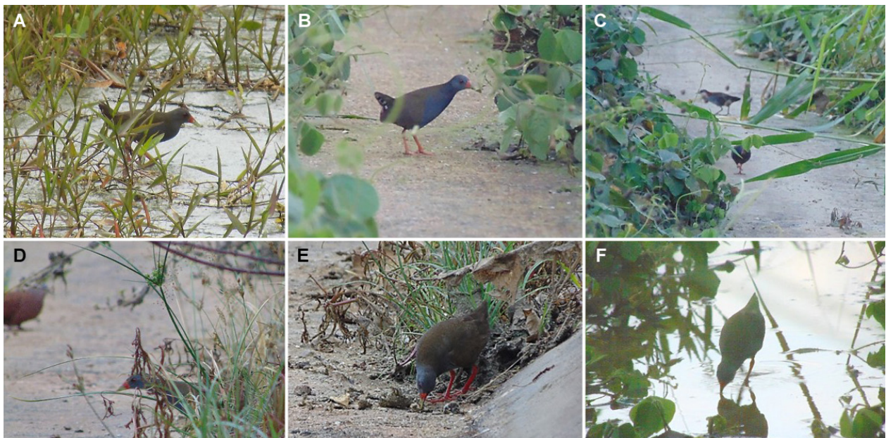
Figure 2. Mustelirallus erythrops (Sclater 1816). A, B. Individuals in a rainwater channel parallel to the runway of the Alfredo Vásquez Cobo International Airport, in Leticia, Colombia: (A) June 2016 and (B) February 2018. C, D. Individuals feeding in the rainwater channel: next to (C) Gray-breasted Crake, Laterallus exilis , and (D) Ruddy Ground-Dove, Columbina talpacoti . E, F. Individuals feeding: (E) during the dry season, March 2018, and (F) during the rainy season, May 2018.

Our data confirm the presence of the Paint-billed Crake in Colombia’s Amazon region and provide evidence that supports that the Paint-billed Crake has a wider distribution than previously known. In Colombia,