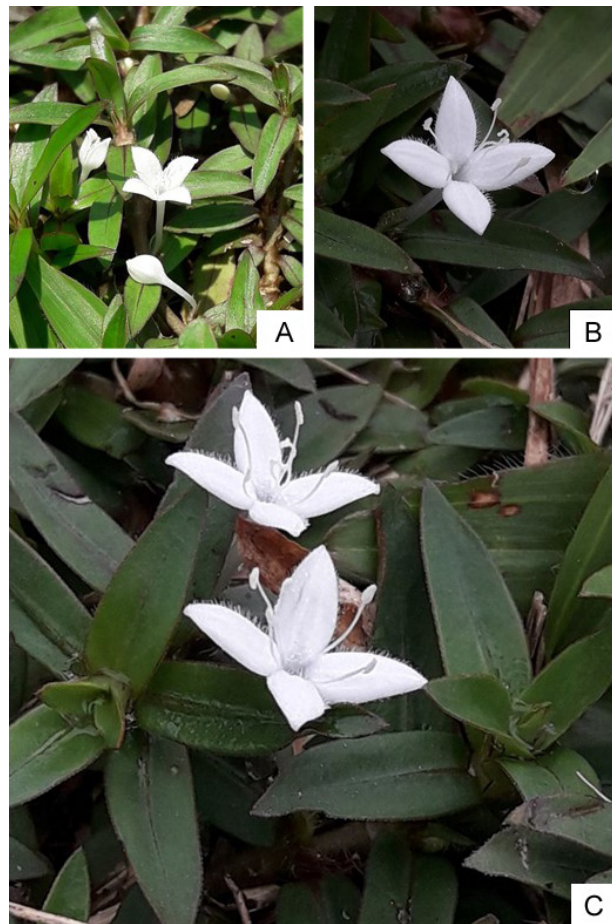
Figure 2. Diodia kuntzei A. Habit and details of margins and reddish veins of leaves. B, C. Details of inflorescence: flowers with pilose lobes and exerted stamens.

Amazonas: Careiro, Rio Solimões, South bank, 10 km E of Boca de Janaucá, 3 Oct. 1973, Berg, C.C. 17589.0 (NY1061132). • Amazonas: Boca do paraná do Cambixe,