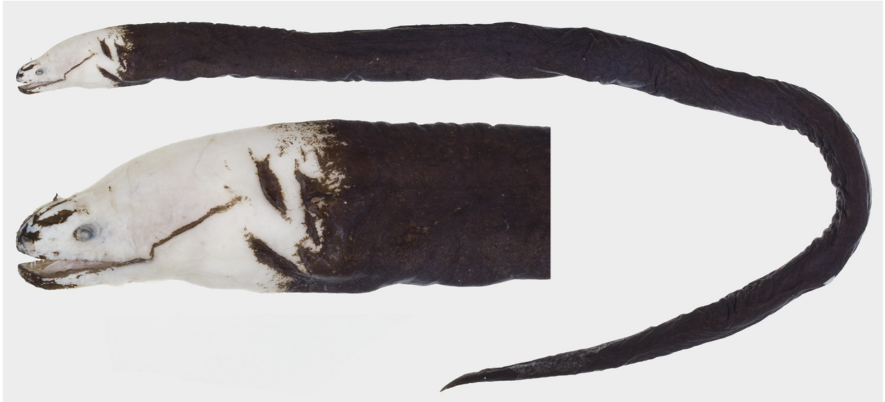
Figure 1. Uropterygius xenodontus , FAKU 141066, 516 mm TL, from stomach content of Laticauda colubrina captured at Iriomote Island, Ryukyu Islands, Japan.