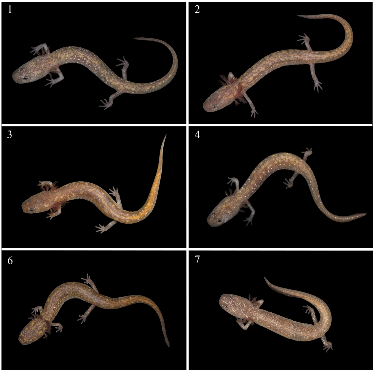
Figure 2. Specimens of Eurycea sosorum in life from the new localities reported here. Numbers correspond to localities in Figure 1. 1, Emerald Spring (TNHC 102948); 2, Bello Spring (TNHC 102949); 3, Pearly's Spring (TNHC 101241); 4, Ben McCulloch Spring (TNHC 100830); 6, Spillar Ranch Spring 2 (TNHC 96996); and 7, Backdoor Spring (TNHC 102716). Locality number 5 (Stuart Spring) is not pictured.

in the Hill Country portion of the Trinity Aquifer (Ashworth 1983, Bluntzer 1992, Chowdhury 2008, Jones et al. 2011). Because the Barton Springs segment receives a proportion of its recharge from the Trinity Aquifer—both via interformational, subsurface flow as well as surface streamflow originating from Trinity springs (Mace et al. 2000, Green et al. 2011)—any ecologically relevant policy for the conservation of E. sosorum and the regional aquifer ecosystem must include the contributing zone.