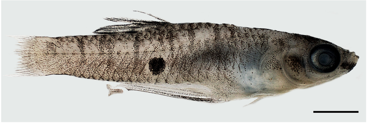
Figure 1. Male of Phallotorynus victoriae , UFRGS 23645, 15.3 mm SL, captured in Uruguay river basin, Rio Grande do Sul, Brazil. Left to right image for better visualization of the gonopodium. Scale bar = 2 mm.

Sul state, southern Brazil and from the Uruguay river basin is reported here, which suggests a broader distribution for this species.