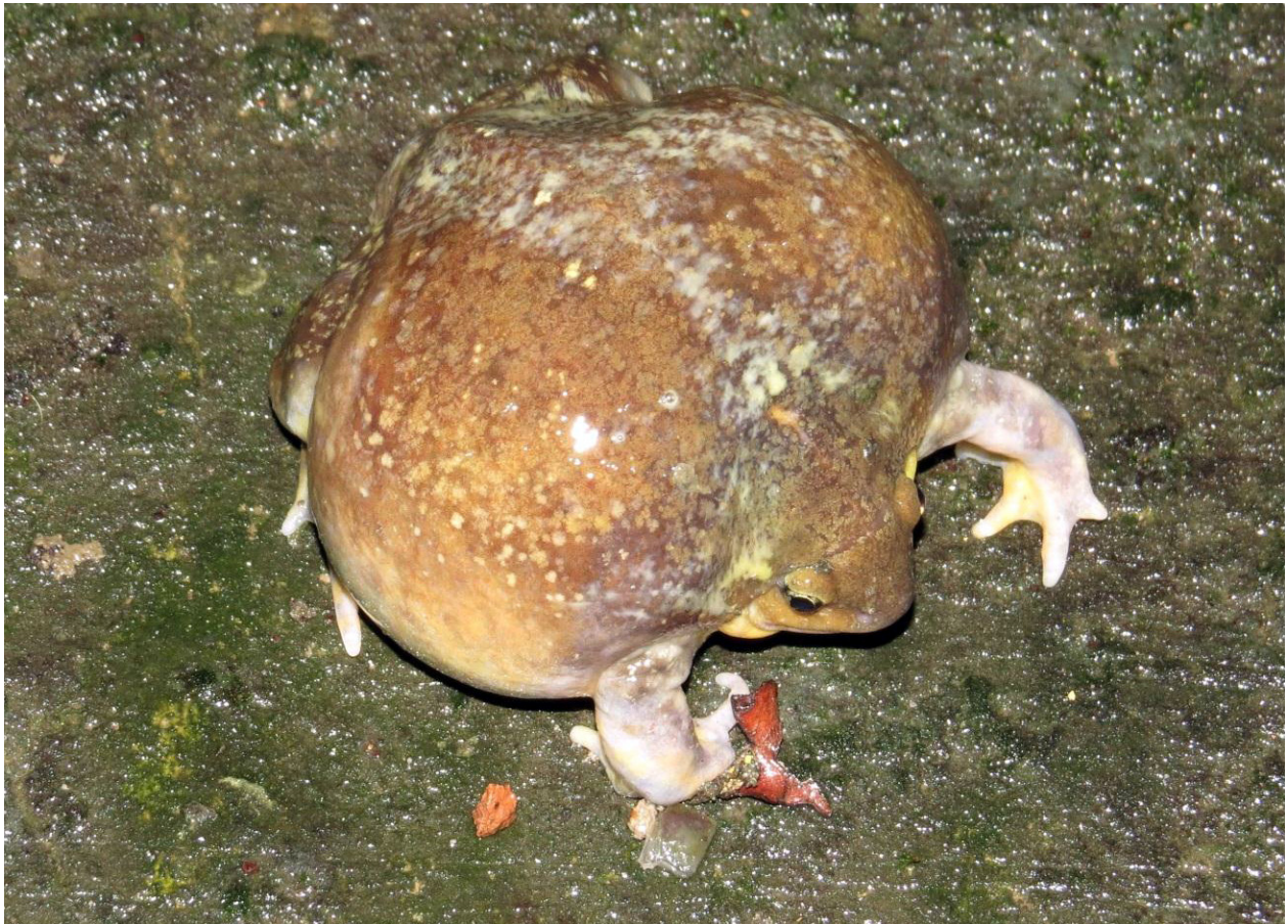
Figure 1. Adult female Uperodon globulosus from Natore, Rajshahi division.

individual, it was observed inflating its body. This specimen agrees with the description in Asmat (2009), Hasan et al. (2014), and Khan (2015) by having a variable dorsal color within the range of variation known for the species (reddish brown to greenish grey or olive), a dirty whitish ventrum, a granular anal region, fingers not webbed (with the first finger shorter than the second), fingertips rounded, hind limbs short, and toes with rudimentary webs (Fig. 1).