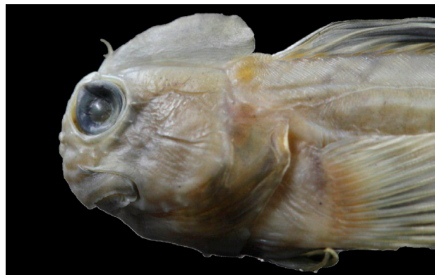
Figure 5. Pattern of crest in Istiblennius lineatus (male) from the Makran Sea, Iran.

The lined rockskipper, I. lineatus , has a wide distribution range and it is found in the Indo-Pacific and Western Central Pacific oceans (Kami 1971). They inhabit the intertidal zone of rocky shores and rocky reef flats (Lieske and Myers 1994), and are found in the rock pools, har-