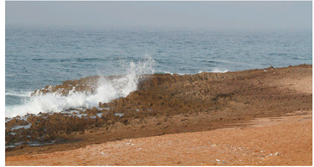
Figure 7. Darya Bozorg shore, Chabahar, Sistan and Baluchistan Province, Iran, a new collection site for Istiblennius lineatus .

HM collected the specimens; HM and HRE examined and identified the specimens and prepared, reviewed, finalized, and approved the manuscript.