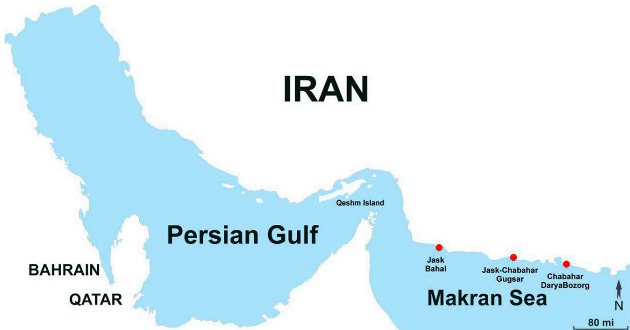
Figure 1. Sampling sites of Istiblennius lineatus (red circles) from the Iranian coast of the Makran Sea.

lineatus (Valenciennes, 1836) from the Iranian coast of Persian Gulf and Makran Sea and provide a morphological description of the specimens supporting such record.