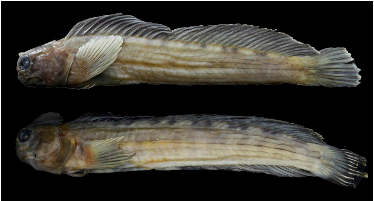
Figure 2. Male (above) and female (below) specimens of Istiblennius lineatus from the Makran Sea, Iran.