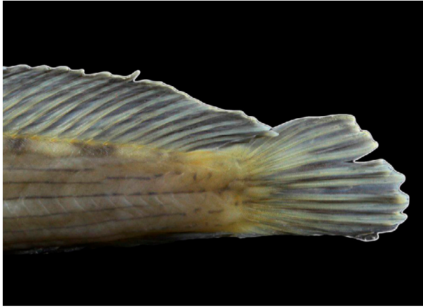
Figure 6. Pattern of caudal peduncle in Istiblennius lineatus (female) from the Makran Sea, Iran.

bors, and mangrove zones (Kuiter and Tonozuka 2001), where they graze on algae present on the rocks. The present record represents a new addition to the marine fish species list for Iran, showing high biodiversity for the region. The record of the lined rockskipper in Iranian waters indicates that a suitable habitat for this species occurs along the Iranian coast of the Makran Sea.