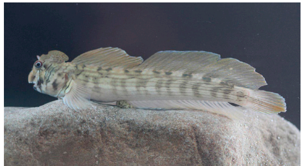
Figure 4. Istiblennius pox , male, Ramin, Chabahar, Sistan and Baluchistan Province, Iran.

rays; color pattern on caudal peduncle of males usually of dark stripes, dashes or squiggles; pattern on caudal peduncle of females of dark spots (Fig. 6); soft portion of dorsal fin with diagonal black lines. Total dorsal-fin elements of males 35–38 (rarely 38), of females 34 to 38 (rarely 38); and total vertebrae 39–43 (usually 40–42, both sexes) (see Springer and Williams 1994).