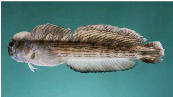
Figure 3. Istiblennius lineatus , male, Papua New Guinea, Cape Croisilles.