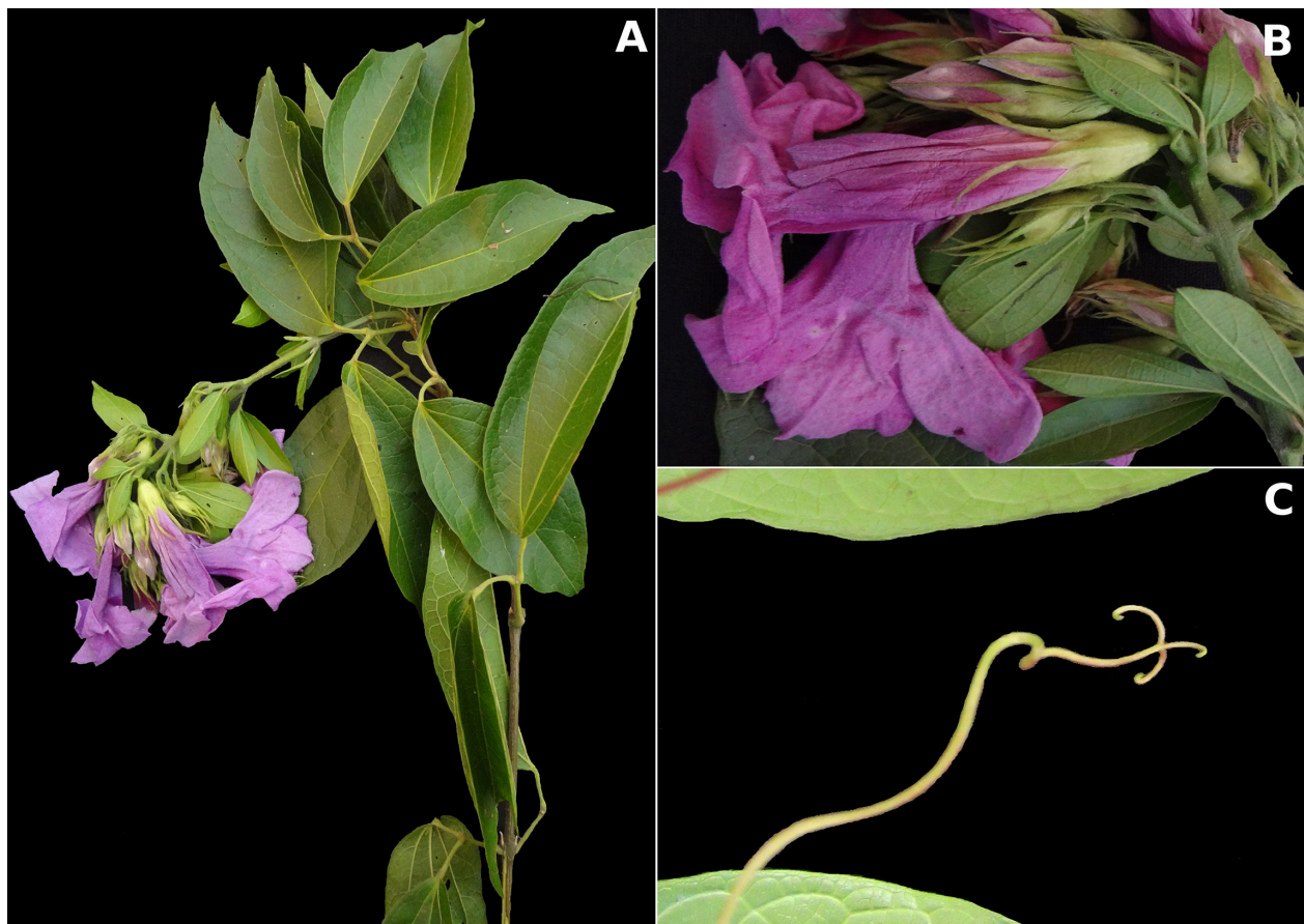
Figure 1. Mansoa minensis M.M.Silva-Castro. A. Fertile branch. B. Detail of the inflorescence and calyx. C. Trifid tendril.

ses of herbarium specimens, and comparison to type specimen images as well. The collected and examined specimens were deposited at CVRD and HASSI herbaria. Only fully developed structures were used for the morphological description. Terms used to describe two-dimensional shapes follow Hickey (1973), those used to describe indumentum are according to Payne (1978). Inflorescence type is according to Weberling (1989).