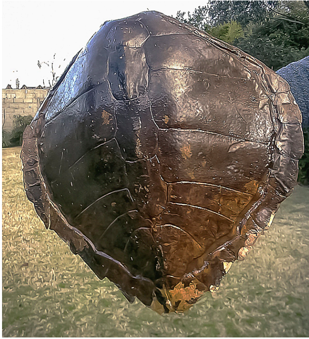
Figure 2. Record 1, a carapace of Lepidochelys olivacea found in a restaurant in La Coronilla, Rocha, Uruguay.