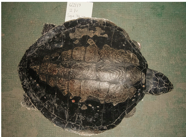
Figure 3. Record 6, a live Lepidochelys olivacea found on the beach at El Barco, Santa Teresa National Park, Rocha, Uruguay.

Stranding records included: a bycatch in which the turtle was entangled in an artisanal coastal gill net causing its death (record 4); a rescue alert in which the turtle was found alive (record 6) with the frontal flippers amputated (Fig. 3); and a stranded dead turtle (record 7). Record 6 is the southernmost stranding record of an alive L. olivacea in the western Atlantic Ocean to date. The turtle was transferred immediately to the Karumbé Rescue Center for first aid and veterinarian assistance, but after 6 months of treatments, it died due to multiorgan failure (Table 1, Fig. 1).