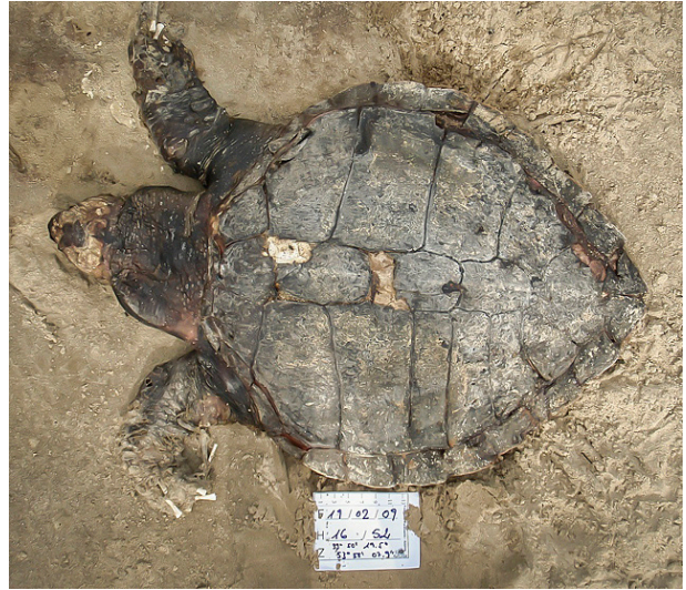
Figure 4. Record 5, a stranded, dead, Lepidochelys olivacea at Palmares de la Coronilla, Rocha, Uruguay.

Records 5 (Fig. 4) and 8 were registered as stranded dead turtles through beach surveys (Table 1, Fig. 1).