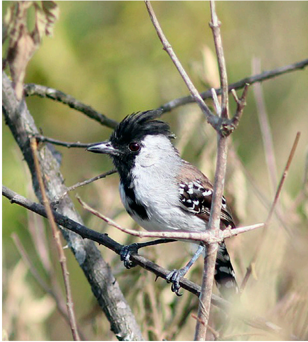
Figure 1. Silvery-cheeked Antshrike, Sakesphorus cristatus (Wied-Neuwied, 1831), male in a Caatinga fragment in the state of Sergipe, Brazil.