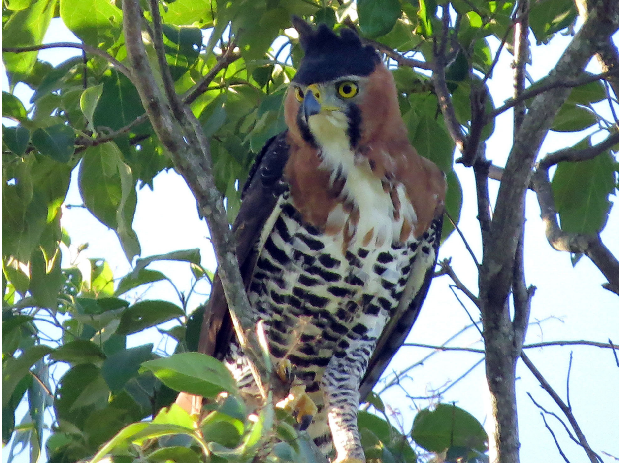
Figure 2. Adult individual of Spizaetus ornatus photographed after play back at Morro do Diabo State Park, westernmost state of São Paulo, southeastern Brazil.

Uezu (2006) failed to record the species at Morro do Diabo State Park between 2002 and 2005. Because of an unpublished and undocumented previous sighting of the species, at that time he suggested it was highly threatened and probably extinct in the reserve. Likewise, no records come from the Mantiqueira mountain range. However, as there is suitable habitat for the species, we predict it is likely to be recorded within the Mantiqueira mountain range in São Paulo as well as in the states of Minas Gerais and Rio de Janeiro. Similar to what occurred in Morro do Diabo State Park, it may have been overlooked due to its low densities and large home ranges, estimated to be approximately 19 km 2 for adult males (Whitacre et al. 2012).