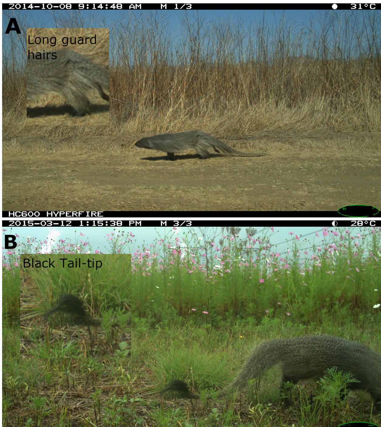
Figure 2. Camera trap photographs of Egyptian Mongoose, Herpestes ichneumon (Linnaeus, 1758). A. Detail of the characteristic long guard hair, long hair at base of tail, but here black tail-tip is not apparent. B. Detail of the characteristic black tail-tip.