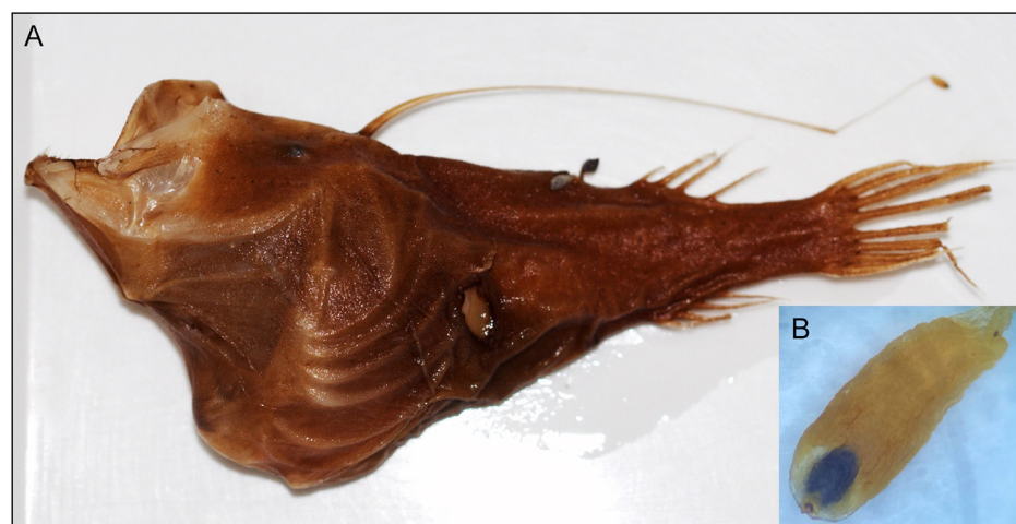
Figure 1. Specimen of Ceratias uranoscopus (Murray, 1877), 101 mm SL, deposited at the fish collection of the Museo de Zoología of the Universidad de Costa Rica (Catalog: UCR 3050-002). Inset showing detail of the esca.

Anglerfishes of the family Ceratiidae are poorly known (Pietsch 1986, 2009; Mincarone et al. 2021). Relatively few studies have been conducted on this group, and most of them include only basic or very general