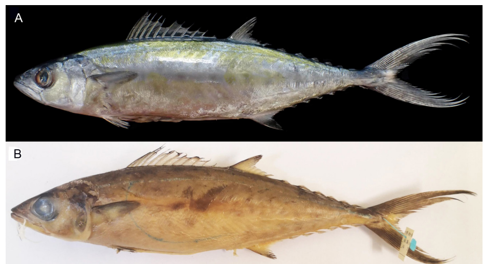
Figure 1. Grammatorcynus bilineatus , Kuala Nerus, Terengganu, Malaysia. a. Fresh specimen, UMTF 10392, 264 mm SL. b. Preserved specimen, UMTF 10391, 252 mm SL.

The presence of G. bilineatus in Peninsular Malaysia was anticipated, given its widespread distribution near coral reefs in the Indo-West Pacific (Collette and Gillis 1992). Furthermore, the coastal waters off Pulau Karah, Terengganu, are known for their abundant coral reefs and associated sandy bottoms. Grammatorcynus bilineatus is rare in Malaysian waters. Previously, it has been documented only in the Celebes Sea of East Malaysia. Our new record extends the known geographic range of G. bilineatus to Peninsular Malaysia