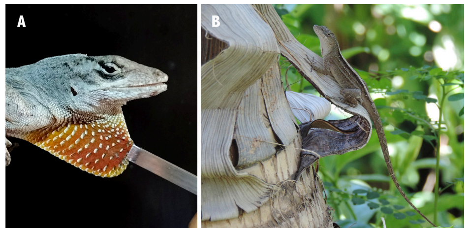
Figure 1. Anolis sagrei , adult male CH-UABC 2603. A. Close-up of the head with the dewlap extended. B. In situ photograph in the nursery of Ciudad Obregón, Cajeme, Sonora.

Copyright © The authors. This is an open-access article distributed under terms of the Creative Commons Attribution License (Attribution 4.0 International – CC BY 4.0)