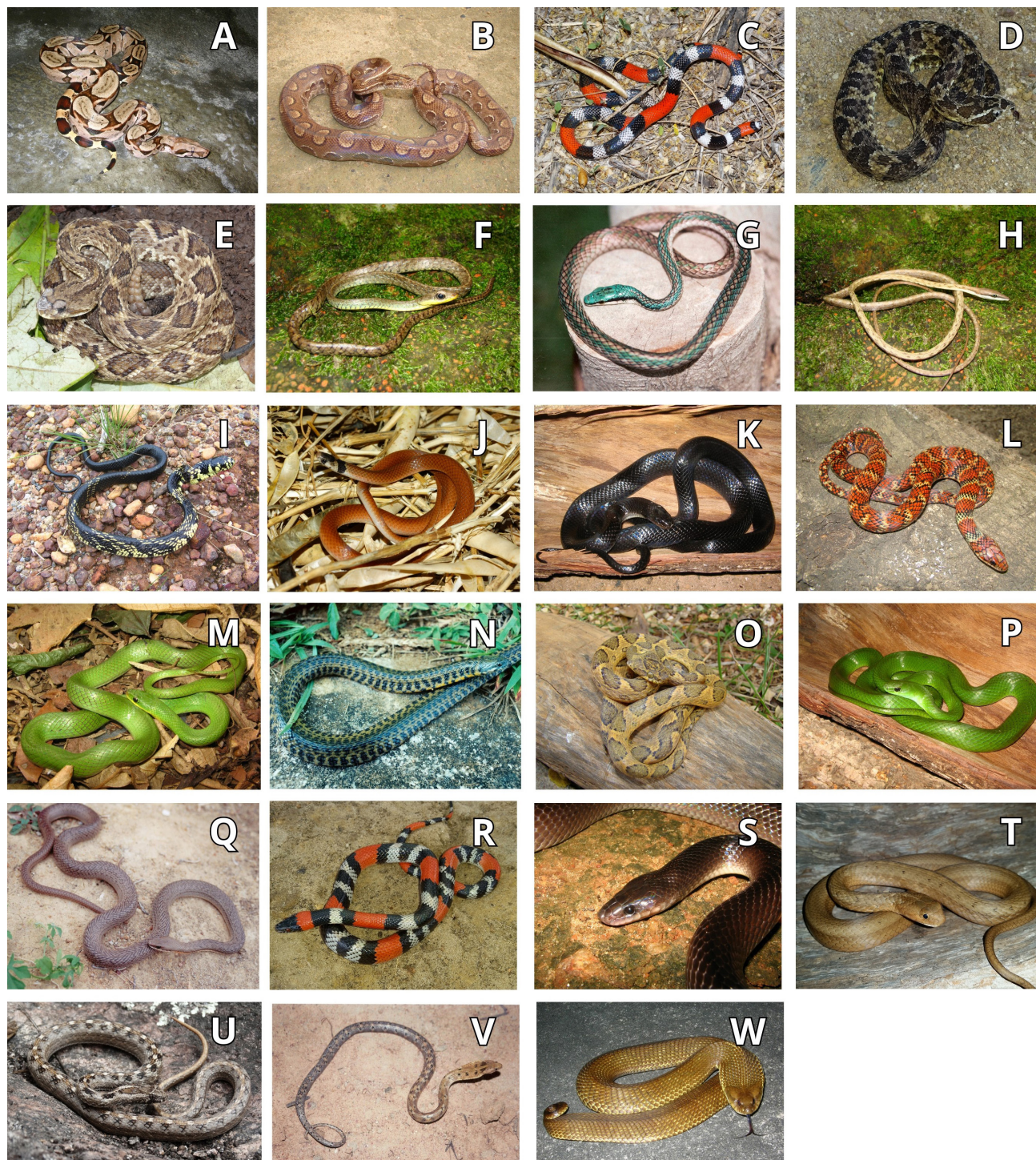
Figure 2. Snakes recorded in the flooded area of Petrolândia: A. Boa constrictor. B. Epicrates assisi. C. Micrurus bonita. D. Bothrops erythromelas. E. Crotalus durissus. F. Chironius exoletus. G. Leptophis dibernardoi. H. Oxybelis aeneus. I. Spilotes pullatus. J. Tantilla melanocephala. K. Boiruna sertaneja. L. Erythrolamprus poecilogyrus. M. Erythrolamprus viridis. N. Helicops leopardinus. O. Leptodeira tarairiu. P. Philodryas olfersii. Q. Philodryas nattereri. R. Oxyrhopus trigeminus. S. Pseudoboa nigra. T. Dryophylax almae. U. Dryophylax phoenix. V. Thamnodynastes sertanejo. W. Xenodon merremii. Species recorded in the Ilha de Paulo Afonso are Chironius exoletus, Spilotes pullatus, Tantilla melanocephala, and Helicops leopardinus. The images are of specimens found in the location close to the study area, and these were not collected and deposited in collections.