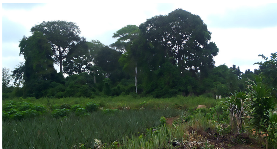
Figure 3. Sacred Forest of Dodja, a tiny biodiverse island in an agricultural landscape.

Conservation status. Diospyros barteri was given a preliminary global Red List status of Vulnerable (IUCN 2024). In Benin, the extent of occurrence (EOO) is 0.002 km 2 , based on current data. This tiny EOO is well below the threshold for Critically Endangered under criterion B1 (IUCN 2012), as for other species with a single occurrence in a country (Wagensommer et al. 2014; Perrino et al. 2023). The population is small, with an estimated 94 individuals. Further surveys and other research are needed to confirm this species’ distribution, origin, and population size, apart from the Dodja population, to better assess its conservation status in Benin.