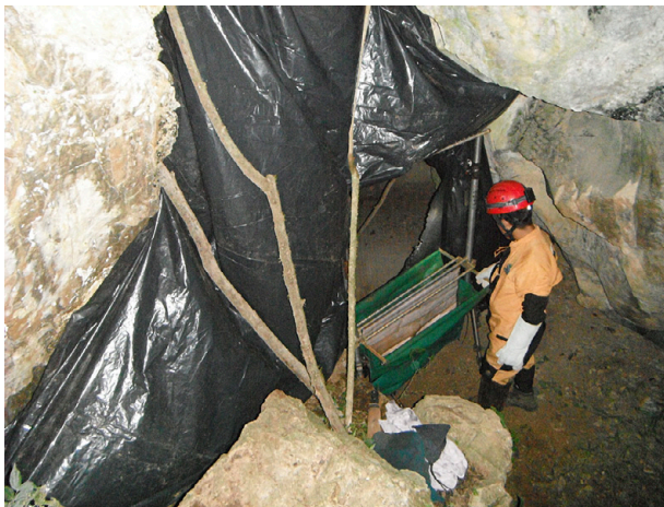
Figure 1. Harp trap installed in the superior entrance of Gruta do Bacaetava, Parque Municipal Gruta do Bacaetava, Colombo, Paraná, southern Brazil.

The specimen of Furipterus horrens was fixed in 10% formaldehyde and preserved in 70% ethanol, with a subsequent extraction of the skull. After recording the external and cranial measurements following Moratelli et al. (2011), the individual was deposited at the Coleção