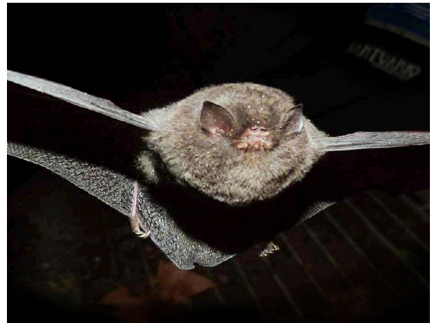
Figure 2. Adult male Furipterus horrens (DZUP-CCMZ 2185) captured at Gruta do Bacaetava in the Parque Municipal Gruta do Bacaetava, Colombo, Paraná, southern Brazil.

Científica de Mastozoologia da Universidade Federal do Paraná (DZUP-CCMZ 2185). The specimen was collected under permit number 43322-2 by ICMBIO/SISBIO.