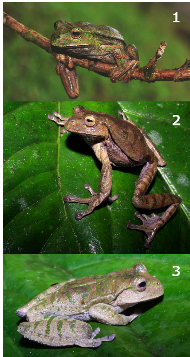
Figures 1–3. Gastrotheca testudinea . 1. Adult male (MZUA.An.0572), Mazar dam, near Guarainag, province of Cañar, Ecuador, 12 June 2014. 2. Adult male (MZUA V.An-1084), and 3. Adult female (MZUA. An.1085), both from Estación Científica San Francisco, province of Zamora-Chinchipe, Ecuador, March and October 2015, respectively.

An adult male (MZUA.An.1084, Fig. 2) and an adult female (MZUA.An.1085, Fig. 3) were collected at two different points in the Estación Científica San Francisco (Table 1, Fig. 4), on March and October 2015, respectively. This site is the third known locality in the province of Zamora-Chinchipe and the southernmost record of the species in Ecuador, extending the species' distribution ca 82 km east-southeast from the nearest known locality (Machinaza Alto). These frogs were active at night on shrubs, 3 and 6 m above the ground, respectively.