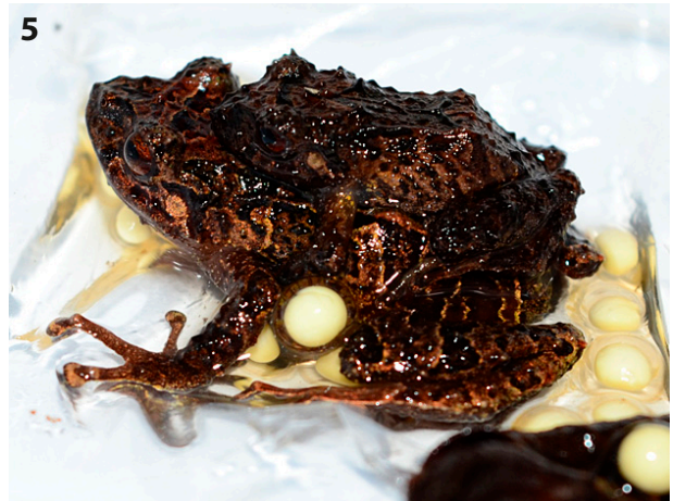
Figures 2–5. Specimens of Pristimantis uisae (Lynch, 2003) found in previously unreported localities. 2. ICN 23319, an adult male from 14.4 km southwest of Sibaté, Quebrada Agua Bonita (Cundinamarca, Sylvania). 3. Uncollected juvenile specimen from Parque Natural Los Tunos (Cundinamarca, San Antonio del Tequendama). 4. ICN 23320, an adult male from 14.4 km southwest of Sibaté, Quebrada Agua Bonita (Cundinamarca, Sylvania). 5. ICN 55891–55892, amplexing pair with eggs from Vereda La Concepción, Reserva Natural Bioandina (Cundinamarca, Guasca).

with Eleutherodactylus [now Pristimantis ] bogotensis ” (field notes of John D. Lynch, 20 June 1981). Photographs are available for ICN 23319 and 23320 (Figs 2, 4).