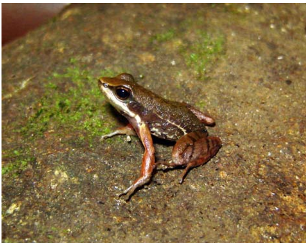
Figure 1. Hylodes pipilans , adult male (ZUF RJ 10319) collected at Reserva Ecológica de Guapiaçu, municipality of Cachoeiras de Macacu, state of Rio de Janeiro, Brazil.

Hylodes pipilans (Canedo & Pombal, 2007) was recently described and belongs to the Hylodes lateristrigatus species group, the most diverse group in the genus, which is currently composed of 17 species (see Canedo and Pombal 2007). The other three species groups are composed of one to three species (Pombal et al. 2002). Hylodes pipilans (Figure 1) is known only from the type locality, near to the Soberbo River at Serra dos Órgãos, municipality of Guapimirim, state of Rio de Janeiro, southeastern Brazil (Canedo and Pombal 2007).