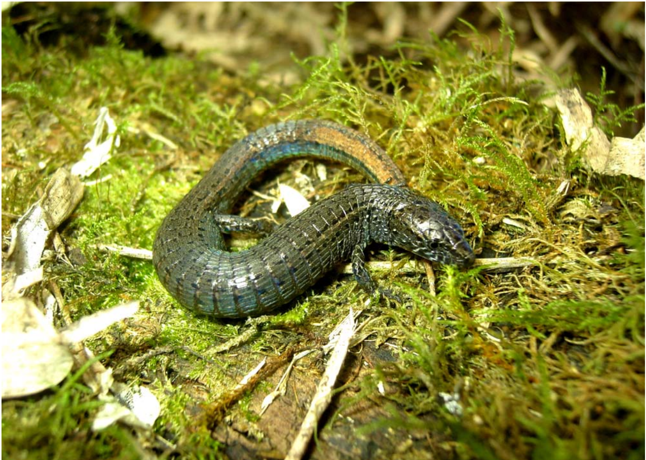
Figure 4. Female of Riama vespertina in life (DHMECN 4114) collected at Reserva Biológica Utuana , Ecuador, on 12 December 2006.

These new records of species of Riama represent a rediscovery of both species after 22 years in the case of R. balneator and 85 years in the case R. vespertina . Riama balneator is still known only from a restricted zone on the Tungurahua volcano. However a range extension of almost 50 km is reported for R. vespertina , but it is still endemic to the southwestern Andes of the province of Loja. Perhaps, the few records of these two species correspond to a lack of interest on these taxa and little research in their area of distribution.