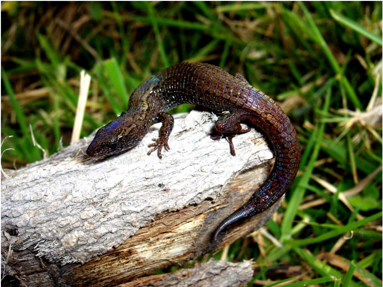
Figure 2. Female of Riama balneator in life (DHMECN 4112) collected at San Antonio Mountains, eastern slope of the Tungurahua volcano, Ecuador, on 07 April 2007.