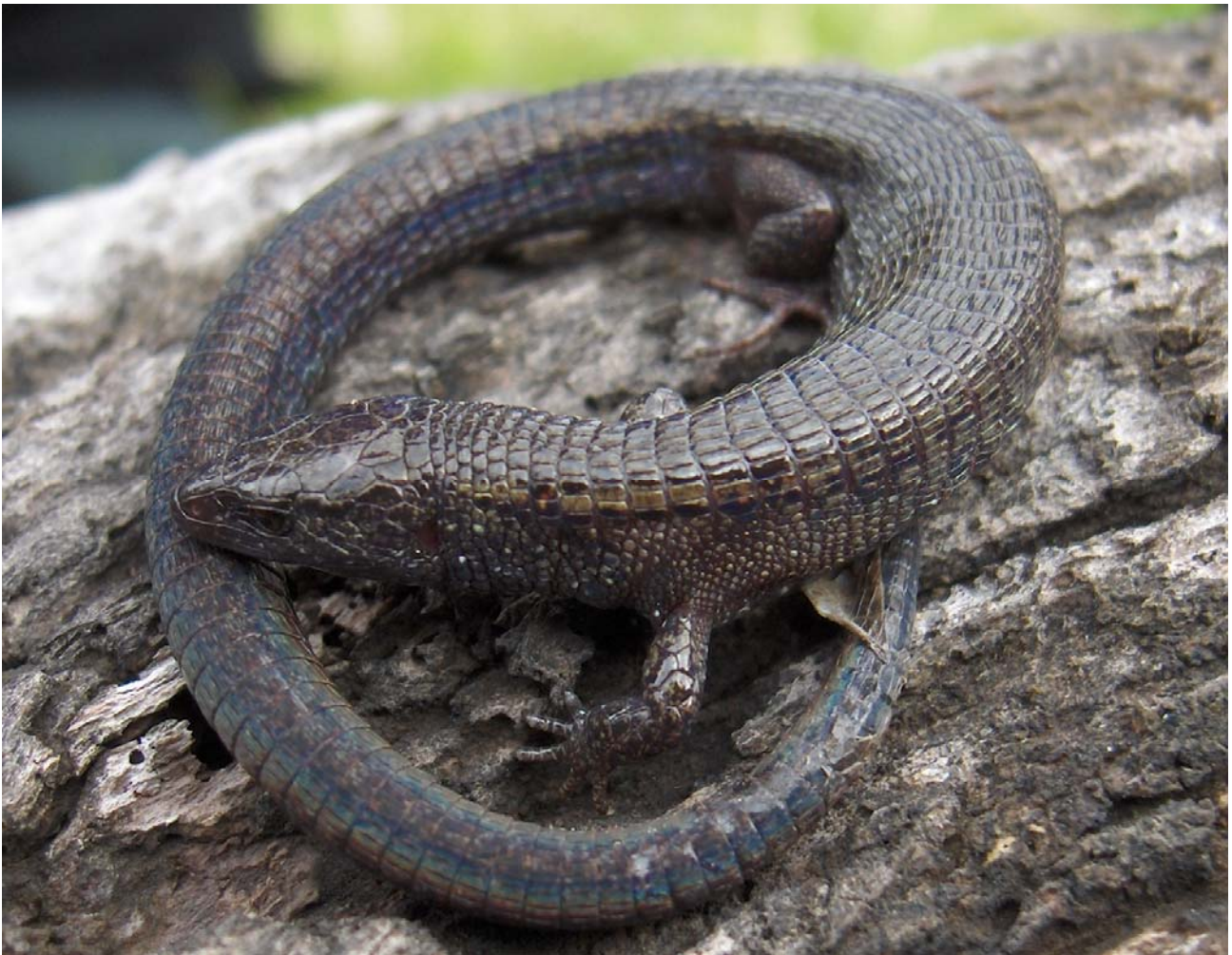
Figure 1. Male of Riama balneator in life (DHMECN 4111) collected at San Antonio Mountains, eastern slope of the Tungurahua volcano, Ecuador, on 07 April 2007.

present everywhere. Males are darker than females, which also has reddish shades on the posteriors half of the body and cream shades on the edges of ventral scales (Figures 1 and 2).