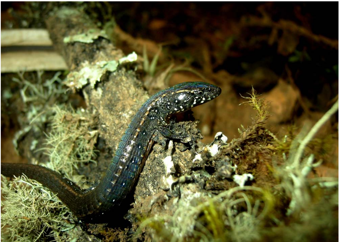
Figure 3. Male of Riama vespertina in life (DHMECN 4113) collected at Reserva Biológica Utuana , Ecuador, on 12 December 2006.

neck to the middle body. Minute black marks are randomly arranged in the head and body. Small white marks are present below the eye and the upper labials. Ten distinct ocelli are present laterally from the neck to the hind limb. The ventral surfaces are reddish cream with brown marks. The male has darker and more distinctive ocelli than females (Figures 3 and 4).