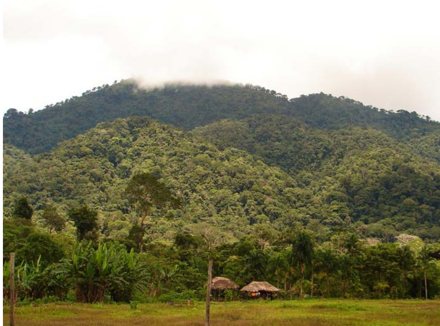
Figure 3. Tangoshiari's vegetation at 830m, Cuzco, Peru.