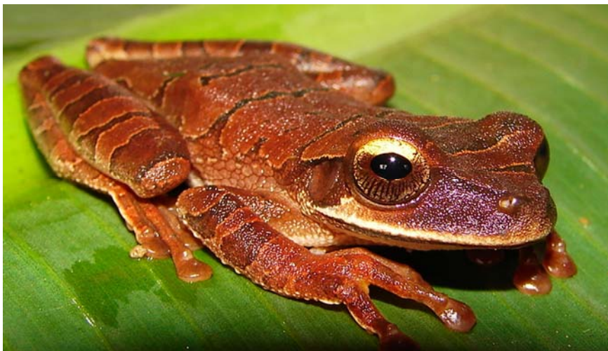
Figure 1. Osteocephalus leoniae (CORBIDI 00306, female, SVL = 53.2 mm) from Tangoshiari, Cusco Region, Perú.

Both localities are situated between the mountain forest and the lower Amazonian basin of Cusco, next to the Machiguenga Communal Reserve. Agricultural lands and fragmented natural areas cover most of the region (Figure 3). Both specimens were collected at night (21:00 h, temperature 27 °C), 200 m uphill from a stream, during the wet season.