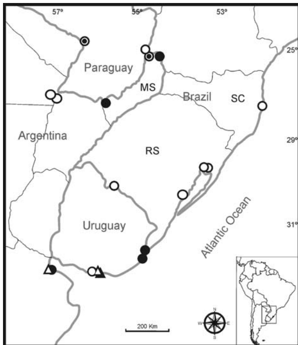
Figure 2. Southernmost known localities for H. mabouia (circles) and T. mauritanica (triangles) in South America. Open marks correspond to literature data (see text), and solid ones are the new localities cited in this work. MS, Misiones Province; RS, state of Rio Grande do Sul; SC, state of Santa Catarina.

We also detected the introduction of an adult specimen of the colubrid snake Mastigodryas bifossatus triseriatus at the locality of Chuy, in a wood shipment transported by truck from Rio Grande do Sul in 2002 (MNHN 7180, JEG). Mastigodryas bifossatus was previously considered to occur in Uruguay by Amaral (1929, as Drymobius bifossatus ) and also Peters and Orejas-Miranda (1970) cited Mastigodryas bifossatus bifossatus for this country. However, no specimens were reported to have been collected in Uruguay until the present work (see Carreira et al. 2005). Few specimens of Tarentola mauritanica were previously collected in a urban area of Montevideo city, for which the occurrence of a resident population was suggested (Achaval and Gudynas 1983). Herein, we report the collection of an adult specimen at a new locality, in 2000, at the intersection of Samuel Blixen street and Mataojo street, Malvín, Montevideo (34°53' S, 56°07' W; MNHN 7172, CP). This record is about 7 km southeast (straight-line distance) from previous ones, and we do not know whether it corresponds to a new introduction episode or to a range expansion within the urban area of Montevideo. The new localities reported in this work for H. mabouia and T. mauritanica are shown in Figure 2.