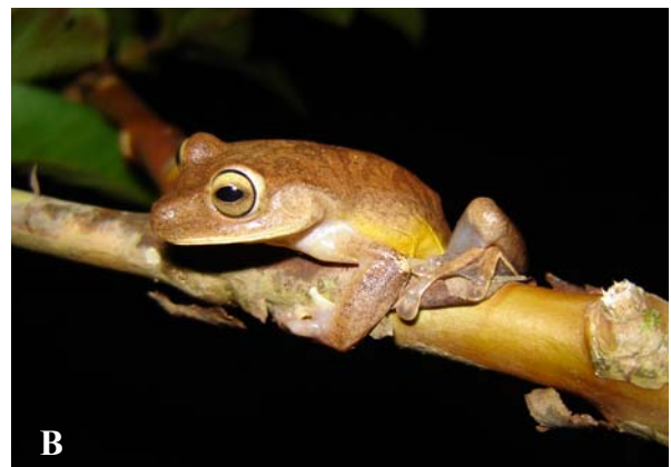
Figure 1. Adult male (A) and female (B) of Bokermannohyla izecksohni registered in the municipality of Cotia, state of São Paulo, southeastern Brazil.