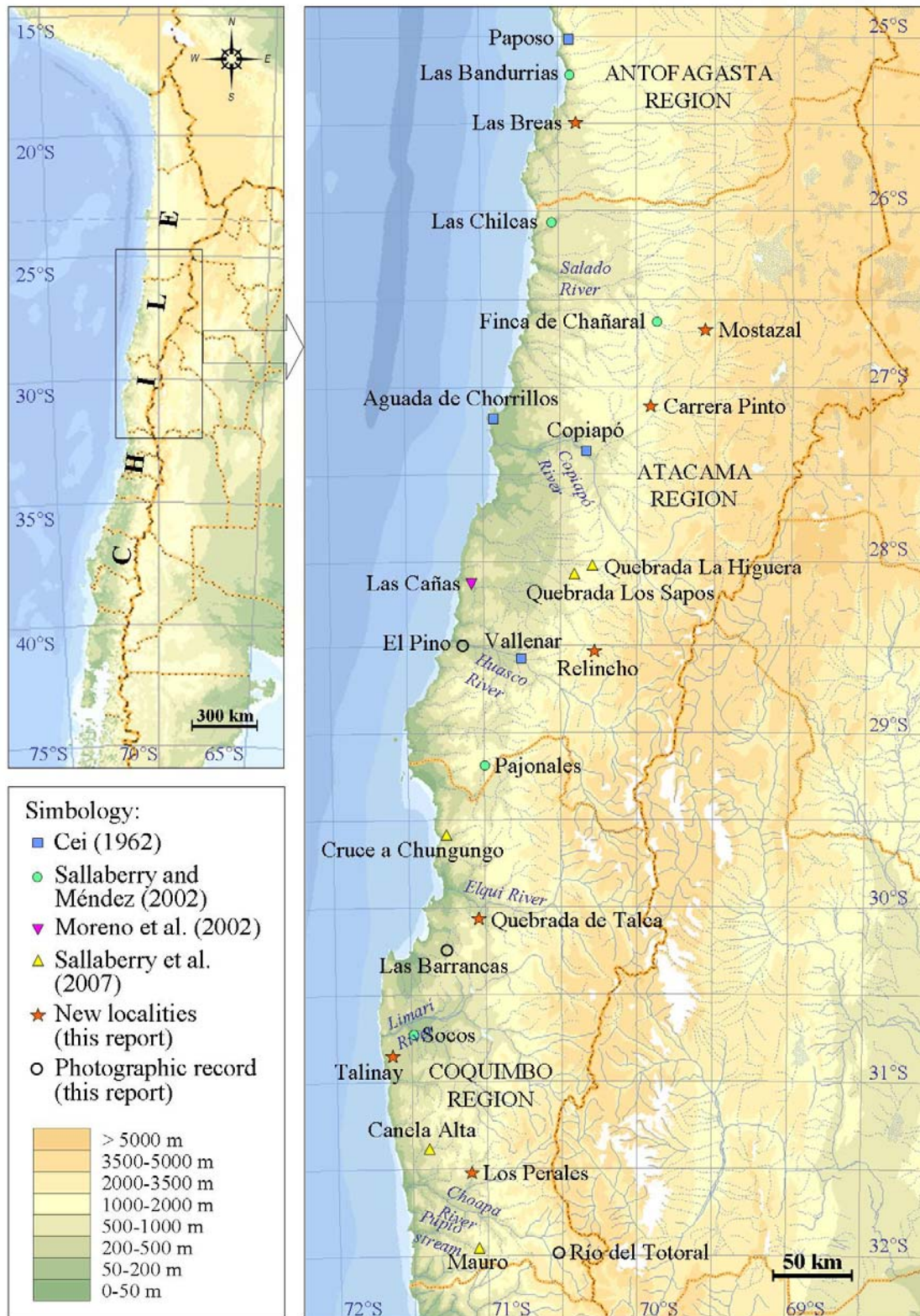
Figure 1. Distribution map of Rhinella atacamensis showing the 25 localities known to date. The boundaries of the administrative regions and the principal rivers located between 25° and 32° S are also shown. The Choapa River and Pupío stream basins constitute the southern known limit for this species.