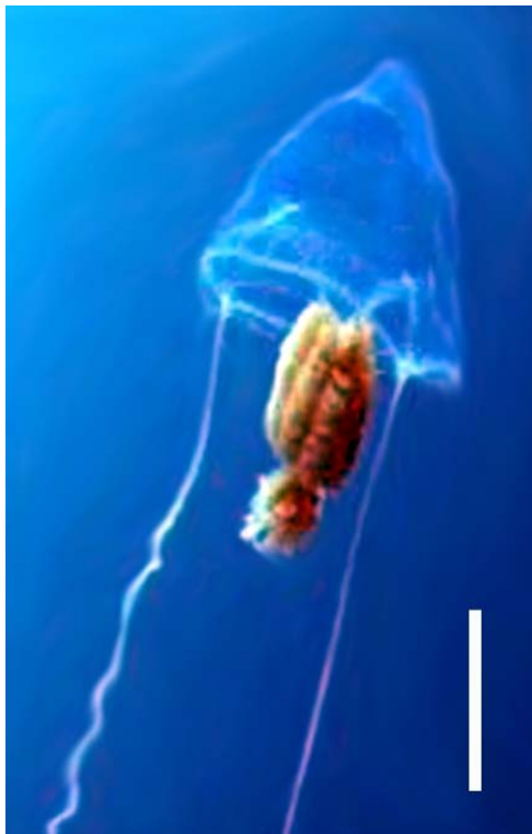
Figure 3. Stomotoca atra L. Agassiz, 1862 swimming in the Laje de Santos. Scale: 3 cm.

A new record of a given species is always an interesting issue. However, when this record occurs in another ocean and different environments (NE and tropical Pacific waters according to Boero & Bouillon 1989; Wrobel and Mills 1998) it becomes more important, because distributional patterns and biology of the species can be emphasized. The distribution of the species Stomotoca atra , with this new record, is very hard to understand, because the ocean currents are not coincident with this allocation (see more in Valiela 1995). That can be hypothesized as the first evidence of a cryptogenic or a report of an extremely rare species in Brazilian waters. Bouillon et al. 1991 discuss about this distribution (NE Pacific, Papua New Guinea and Indian Ocean) and the taxonomy of S. atra . They conclude that is really one species and it is necessary more studies about life cycle and other aspects to understand something about the zoogeography of this species.