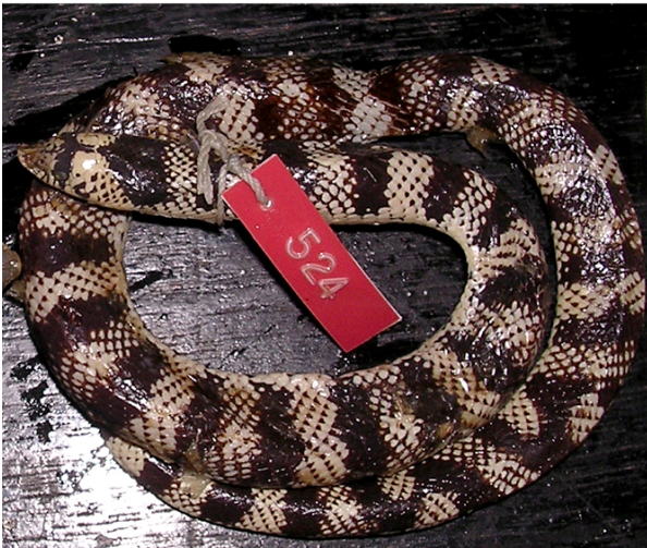
Figure 4. Dorsal view of Lystrophis semicinctus (MACN EX-CENAI 524) from Selva, province of Santiago del Estero, showing 18 pairs of black bands on the body.

CENAI 524) (Figures 1 and 4). The specimen from Salta (MLP-JW 307) represents a historical record, since the species was not reported for this province after 1898. The record of the specimen from Selva, Santiago del Estero (MACN EX-CENAI 524), represents a sympatric zone between L. pulcher and L. semicinctus in the province of Santiago del Estero. Moreover, this record fills a gap in the distribution of L. semicinctus between the localities of Concordia, province of Entre Ríos (located 425 km south east far from Selva) and El Cadillal, province of Tucumán (located 467 km north west far from Selva) given by Scrocchi and Cruz (1993).