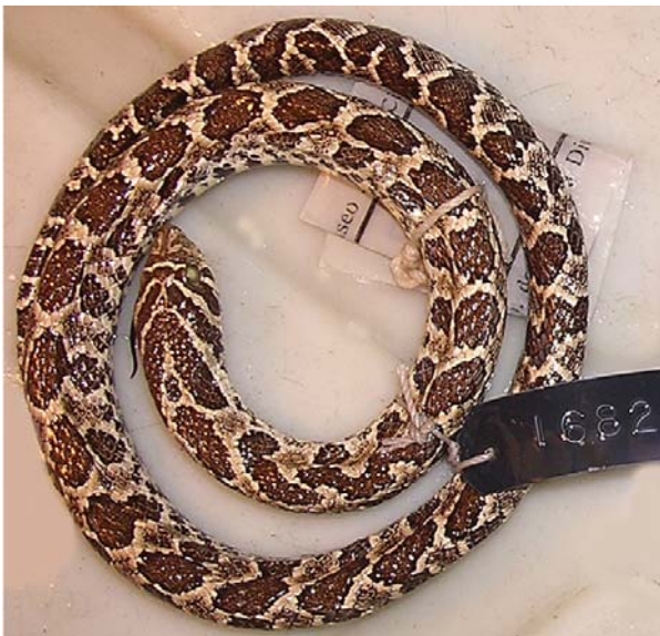
Figure 2. Dorsal view of Lystrophis dorbignyi (MACN EX-CENAI 1682) from Las Lajitas, province of Salta.