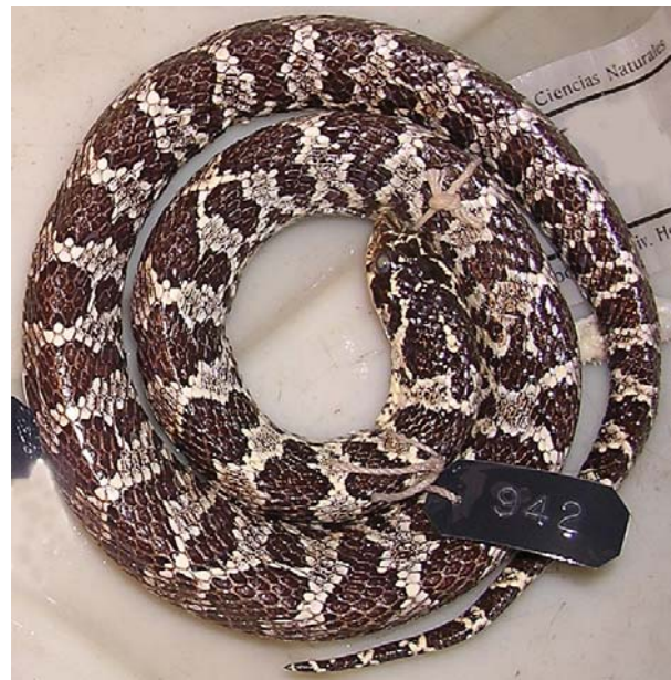
Figure 3. Dorsal view of Lystrophis dorbignyi (MACN EX-CENAI 942) from La Estrella, province of Salta.

Orejas-Miranda (1966) and Cei (1993) mention that L. dorbignyi occurs between 25° S and 40° S, therefore the specimen MACN EX-CENAI 942 from La Estrella, province of Salta, widens this range far to 23°49'0" S and 40° S latitude, on the western limits of the distribution of the species.