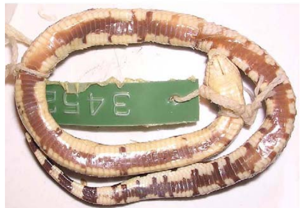
Figure 5. Dorsal and ventral views of Lystrophis pulcher (MACN 34529) from San Juan province showing 12 pairs of black bands on the body and 2 ½ on the tail, and juvenile pattern coloration. Arrow points the vent.