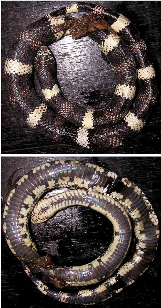
Figure 6. Dorsal and ventral views of Lystrophis pulcher (MACN 34442) from the province of San Luis showing 11 pairs of black bands on the body and 1 ½ on the tail, and typical adult blackish coloration

Ávila and Carrizo (2003) provided a list of 14 specimens of L. semicinctus from the province of San Luis, where the specimen MACN 34442 was misidentified. MACN 34442 from the department of Junín, locality of Santa Rosa del Conlara (32°20' S, 65°12' W) (Figure 1), collected by Gustavo R. Carrizo in January 1993, 330 mm SVL, 51 mm TL, belongs to L. pulcher since it shows 11 pairs of black bands on the body, 1 ½ pairs of black bands on the tail, and a typical adult blackish coloration (Figure 6). This represents another contact area between L. semicinctus and L. pulcher in the province of San Luis, as mentioned by Scrocchi and Cruz (1993).