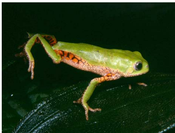
Figure 1. Adult of Phyllomedusa ayeaye from the type locality, Morro do Ferro, Minas Gerais, Brazil.

Phyllomedusa ayeaye (Figure 1) is a medium-size hylid treefrog described as Pithecopus ayeaye by B. Lutz (1966). The present known distribution of this species is limited to the type-locality: Morro do Ferro (21°48' S, 46°35' W; 1400-1540 m), municipality of Poços de Caldas, state of Minas Gerais, southeastern Brazil. Cardoso et al. (1989) studied the utilization of resources for reproduction in an anuran community of this area and described some ecological aspects of P. ayeaye .