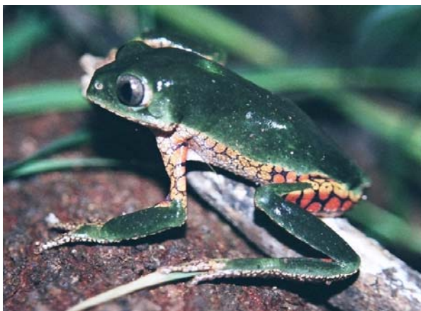
Figure 3. Adult male of Phyllomedusa ayeaye from Parque Estadual das Furnas do Bom Jesus, São Paulo, Brazil.

they were collected is a transition between typical cerrado ( cerrado sensu stricto ; Ratter et al. 1997) and secondary semideciduous forest (Franco et al. 2007; Oliveira-Filho and Fontes 2000). This new record for the state of São Paulo extends the distribution of P. ayeaye approximately 200 km to the northwest of the type-locality (Figure 4).