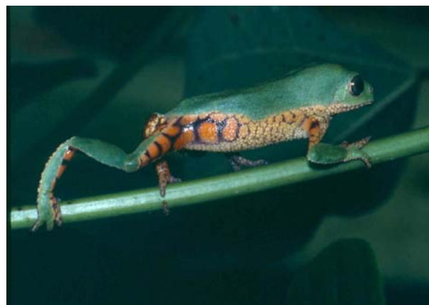
Figure 2. Adult male of Phyllomedusa ayeaye from Parque Nacional da Serra da Canastra, Minas Gerais, Brazil.

During field work at Parque Nacional da Serra da Canastra (approximately 20°10' S, 46°30' W; 900-1496 m), Municipality of São Roque de Minas, state of Minas Gerais, southeastern Brazil, on April 1998, two males and a post metamorph of Phyllomedusa ayeaye were collected (Figure 2). The vegetation at this park is composed by well preserved cerrados (Brazilian savanna; Ratter et al. 1997), campos rupestres (open vegetation on rocky soil; Magalhães 1966), and gallery forest lining the larger rivers (Haddad et al. 1988; Romero and Nakajima 1999). This new record for Minas Gerais extends the distribution of P. ayeaye approximately 175 km to the north of Morro do Ferro, Poços de Caldas (Figure 4).