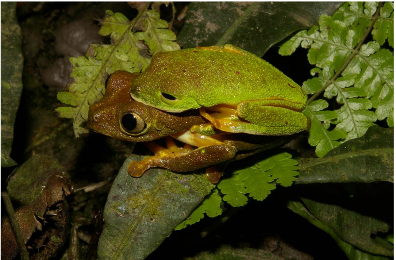
Figure 2. Amplexing pair of Hylomantis medinai on the banks of a still pond on Cerro Zapatero, Venezuela (male: MIZA 405; female: MIZA 406).

and color characteristics with a paratype (EBRG-36) of the species, they were identified as H. medinai sensu Cannatella (1980) and Funkhouser (1962). This identification has been verified by Jesús Manzanilla. Now, three populations of H. medinai are known, whereas the last localities (Bejuma and Cerro Zapatero) represent range extensions of approximately 60 and 100 km west of the type locality, respectively. The population of Cerro Zapatero was encountered around a still pond situated in a depression between two peaks of the mountain at 1300 m a.s.l. Some males were calling, while other adults were found in amplexus (Figure 2 shows the collected specimens MIZA 405 and 406 as they were found).