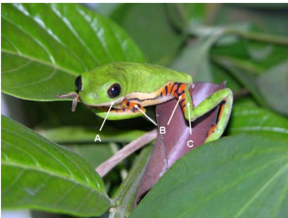
Figure 1. Phyllomedusa azurea . Arrows show three of the diagnostic characters of this species according to Caramaschi (2006). A, narrow white stripe on the upper lip, not reaching the lower eyelid; B, inguinal region and sides of members with black transversal bars over an orange or red background; C, wide green stripe along the dorsal surface of thighs.

Phyllomedusa azurea Cope, 1862 (Figure 1), was recently revalidated and included in the species group of Phyllomedusa hypochondrialis (Daudin, 1800) by Caramaschi (2006). The geographic range of P. azurea was then published as the open formations of the Chacoan regions of Bolivia, Paraguay, and northern Argentina, and in the Pantanal and Cerrado regions of central Brazil (Caramaschi 2006; Frost 2007). Herein, we present the first record of P. azurea for the state of São Paulo, Brazil.