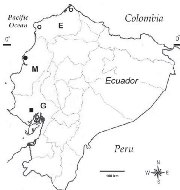
Figure 1. Geographic distribution map of Tantilla supracincta in Ecuador; close circle corresponds to locality reported herein, square to the type-locality, open circles to other literature records, provincial codes: E = Esmeraldas, M = Manabí, and G = Guayas.

Two specimens of Tantilla (adult DFCH-USFQ S101 and juvenile S102; D. F. Cisneros-Heredia's collection, housed at Universidad San Francisco de Quito), collected on 30 June 2004 by Pablo Caqua at Cabo Pasado (00°23 S, 80°28W, ca. 100 m above sea level, Figure 1), province of Manabí, correspond well with the descriptions of Tantilla supracincta (Table 1); including the dorsal pattern (Figures 2 and 3) of black-bordered white crossbars on a red ground color (Wilson 1987, Wilson 1999, Savage 2002, Köhler 2003). This new locality fills the gap between previous Ecuadorian localities of T. supracincta (Figure 1), constitute a first provincial record, and represent the fourth and fifth specimens registered from South America.