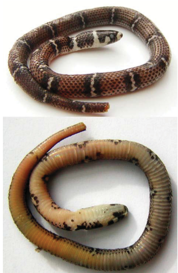
Figure 3. Tantilla supracincta . Dorsal and ventral views of juvenile specimen DFCH-USFQ S102, one year after been euthanized; note reddish rose tint still present. Cabo Pasado, province of Manabí, Republic of Ecuador.