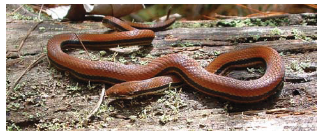
Figure 2. Rhadinaea montecristi (UF 144648) from Cantiles, Parque Nacional El Cusuco, Depto. Cortés, Honduras.