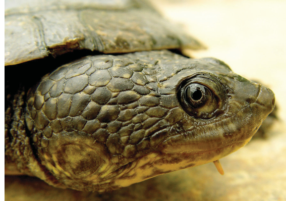
Figure 1. Head details of Mesoclemmys tuberculata collected in the Piauí state, northeastern Brazil.

According to Iverson (1992), M. tuberculata (sensu Bour and Zaher, 2000) has a geographical distribution restricted to the Rio São Francisco and its adjacent basins, probably endemic to the Caatinga biome, northeastern Brazil. On June 30 2005, we collected one individual (female; Carapace length = 224 mm; Carapace width = 174 mm; Plastron length = 213 mm; Plastron width = 132 mm) of M. tuberculata (Figures 1 and 2) in Luís Correia city, Piauí state (02°53'43" S; 41°37'31" W, 14 m above sea level), extending species range in approx. 200 km towards west from previous reports (e.g. Bour and Zaher, 2005; Figure 3). The individual was wandering during day light at 1500 h across coastal dunes nearby PI 315 state highway (ca. 500 m from the coastline). This is the first record of the M. tuberculata within Piauí's littoral zone and constitutes the northernmost record for this species. The individual is deposited in the Herpetological collection of Instituto Nacional de Pesquisas da Amazônia, Manaus (INPA- H; 16020).