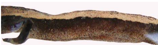
Figure 2. Lateral view of the body of Bolitoglossa biseriata (DFCH-USFQ S032) from 20 km S of Río Guajalito Protected Forest, province of Pichincha, Ecuador.