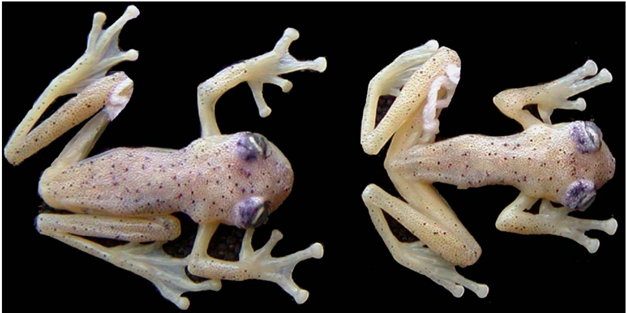
Figure 1. Dorsal view of specimens of Centrolene mariaelenae (QCAZ 18618-9) collected at the Hollín River, province of Napo, Ecuador, on 10 December 2001.