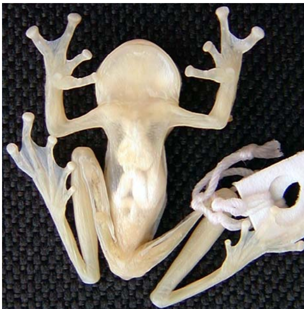
Figure 2. Ventral view of a specimen of Centrolene mariaelenae (QCAZ 18618) collected at the Hollín River, province of Napo, Ecuador, on 10 December 2001.