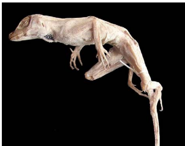
Figure 1. Lateral view of Anolis nitens tandai (LPHA 1879) from Parauá, municipality of Santarém, State of Pará, Brazil.

Anolis nitens tandai Ávila-Pires, 1995 is a diurnal lizard, frequently found on leaf litter of the humid tropical rainforests from Central and Occidental Amazon, in the states of Acre and Amazonas, Brazil (Ávila-Pires 1995; Vitt et al. 2001). On 12 October 2001 at 09:20 h, we collected one specimen of A. nitens tandai (Figure 1) in Parauá (02°50'38" S, 55°10'54" W), municipality of Santarém, State of Pará, Brazil. The individual was observed on the ground in a gallery forest, and it was captured in a shrub 25 cm high.