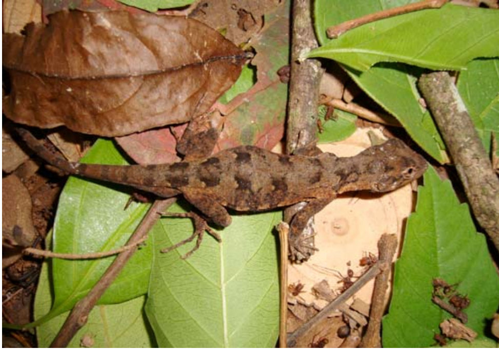
Figure 2. Adult male U. vautieri (CRLZ 000065) collected at Reserva do Boqueirão , municipality of Ingai, state of Minas Gerais.