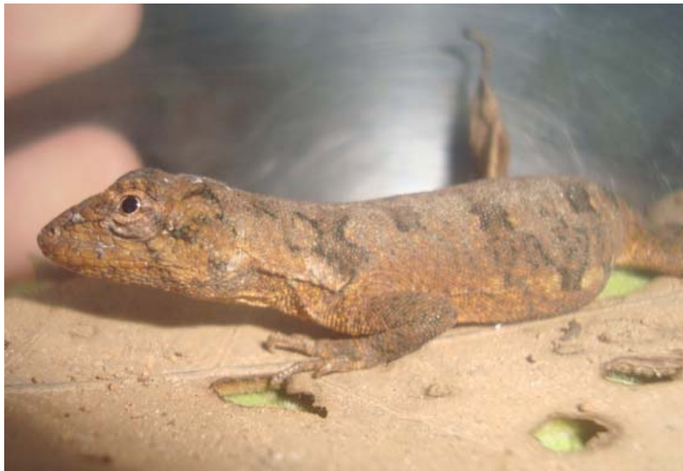
Figure 3. Adult male U. vautieri (CRLZ 000065) collected at Reserva do Boqueirão , municipality of Ingai, state of Minas Gerais.