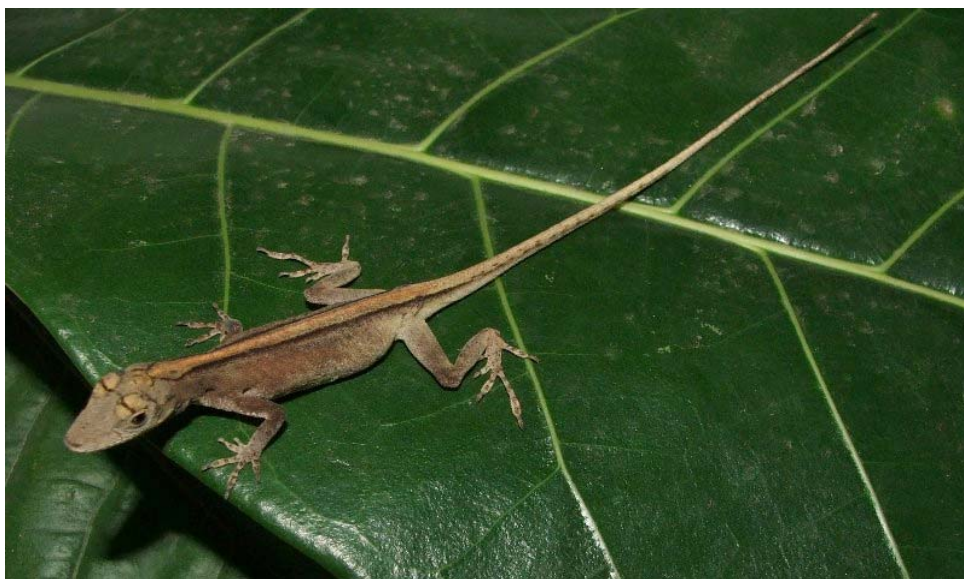
Figure 1. Female specimen of Anolis fuscoauratus collected in the district of Guapiaçu, municipality of Cachoeiras de Macacu, state of Rio de Janeiro, Brazil.

again without providing specific localities of occurrence. Rocha (1998) recorded this species at the Reserva Florestal da Companhia Vale do Rio Doce , in the municipality of Linhares, state of Espírito Santo. Later, Cassimiro et al. (2006) extended its distribution a few degrees southward and 185 km westward to the municipality of Caratinga, state of Minas Gerais. More recently, a lizard identified as Anolis cf. fuscoauratus was reportedly videotaped (but not collected) at the Restinga da Marambaia , state of Rio de Janeiro (Carvalho et al. 2007), which would represent the southernmost record for the species and the first for the state (see Rocha et al. 2004). The present note confirms the presence of A. fuscoauratus in the state of Rio de Janeiro and provides the first voucher record of the species for that state.