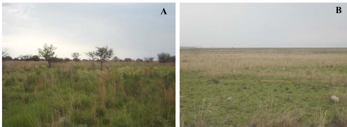
Figure 4. Habitats of Taeniophallus poecilopogon in the province of Corrientes, Argentina. A) Protected grasslands; B) Livestock production grasslands.

(Di-Bernardo and Lema 1987) although Taeniophallus poecilopogon is associated mainly to Pampeana and Espinal biogeographic provinces (Giraud and Scrocchi 2002) and it would be the species of Taeniophallus with more austral distribution (Giraud 2001).