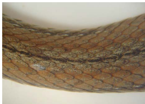
Figure 3. Dorsal coloration pattern of Taeniophallus poecilopogon from the province of Corrientes, Argentina. UNNEC 10148.

The coloration is similar to the specimen housed in the MACN from "Argentina" described by Giraudo (2001). However, we find some differences. The individual collected by us (UNNEC 10148) has a white spot in the parietals near of their internal edge. We did not observed white lines edging the dark vertebral stripe neither the white line of internal half of the paravertebral scales; instead of this, we observed a light brown paravertebral stripe with numerous small black spots (Figure 3). Also, the slightly red longitudinal line was in the sixth dorsal row, and not in the fifth row.