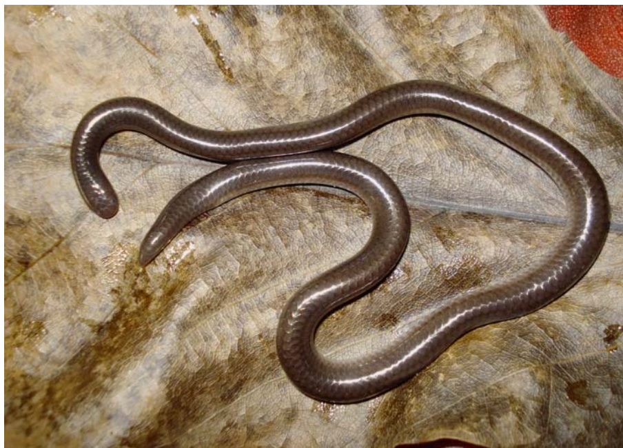
Figure 1. Leptotyphlops salgueiroi (MZUFV 1397), municipality Muriaé, state of Minas Gerais, Brazil.

Amaral (1954) described Leptotyphlops salgueiroi (Figure 1) on the basis of a single specimen from Itá (currently Baixo Guandu), state of Espírito Santo, Brazil. Rodrigues (1997) briefly described a second individual of the species from São José do Macuco (currently São José da Vitória), state of Bahia, Brazil. Passos et al. (2005) redescribed the holotype, reported new specimens and localities, and described the hemipenis of L. salgueiroi . Bilate and Ribeiro (2005) reported the southernmost record of the species in the state of Rio de Janeiro.