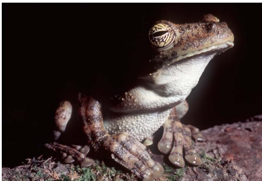
Figure 1. A male specimen of Itapotihyla langsdorffii .

after verifying the geographical coordinates for the older records where I. langsdorffii was found, the coordinates of municipality of Rio Novo actually pertain to municipality of Goianá, state of Minas Gerais (IBGE 2003). Itapotihyla langsdorffii was considered vulnerable in the Red List of Endangered Species of the state of Minas Gerais (Machado et al. 1998). In the revision for this list (Machado et al. 2005), it was not considered threatened, but there is still few information about its occurrence in the state. Herein we report a new distribution record for I. langsdorffii in Minas Gerais (Figure 2).