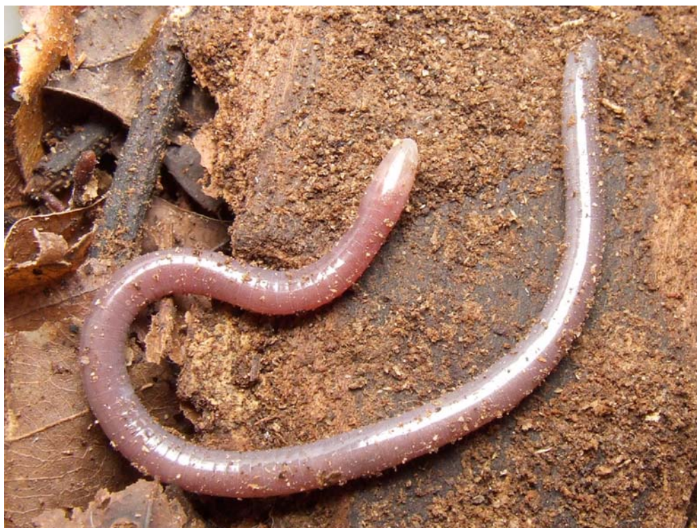
Figure 2. Siphonops hardyi (MZUFV 8748) in life.

Caecilians are hard to collect due to their subterranean or aquatic habits and thus many aspects of their biology are poorly known (Oommen et al. 2000). Currently there are many hydroelectric projects in the Rio Doce basin in Atlantic Rainforest domain. Thus, negative impacts on populations of amphibians may be occurring, due to the landscape alterations promoted by dam flooding. Our record was made in a forest fragment located in the vicinity of an area directly affected by a possible dam flooding.