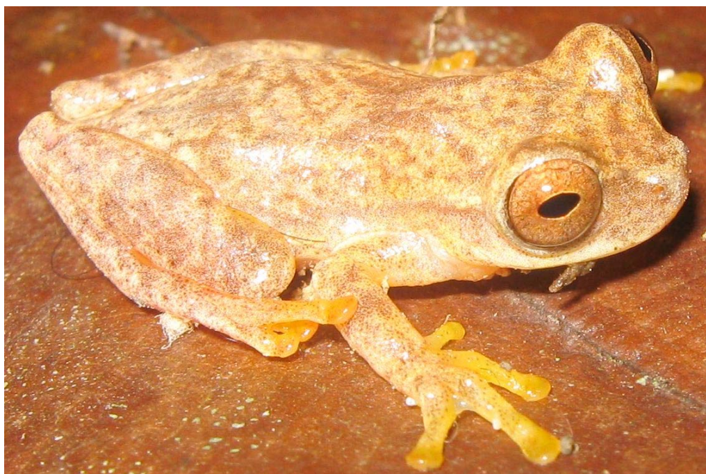
Figure 2. An adult male of Dendropsophus microcephalus (UV-C 15708) from Reserva Forestal San Cipriano y Escalere , municipality of Buenaventura, Colombia.

Dendropsophus microcephalus has been reported as a species able to occur in disturbed areas (Duellman 1970; Bolaños et al. 2004). These observations are consistent with the present report, because the two specimens collected by us were found calling on the vegetation, close to road and human constructions. Moreover, while the field work was being carried out, specimens only were found active during and after rainfall.