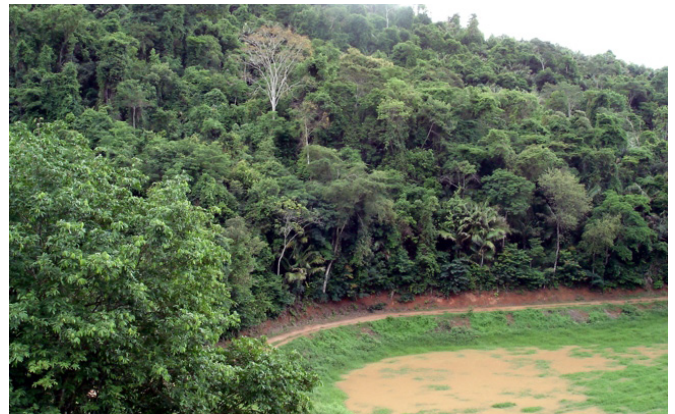
FIGURE 2. General view of the site where Leptodactylus thomei was collected at Mimoso do Sul.

Leptodactylus thomei Almeida and Angulo, 2006 is a recently described species of the L. marmoratus group, only known from the northern region of the state of Espírito Santo. The type locality (Povoação, Linhares, 19°33' S, 39°46' W) is located in cocoa plantations within alluvial forests, at sea level (Almeida and Angulo, 2006). In addition, the original species description reports one specimen heard and collected at Governador Lindemberg,