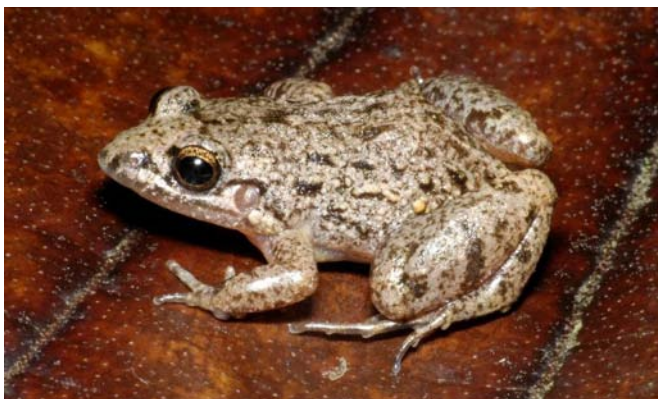
FIGURE 1. Male Leptodactylus thomei (CFBH 22295) collected at Mimoso do Sul, southern Espírito Santo.

The Leptodactylus marmoratus species group (formerly the genus Adenomera ) is taxonomically controversial; some cryptic species can be recognized only by behavioral aspects, such as call structure, genes, reproductive mode and natural history (Angulo et al. 2003; Almeida and Angulo 2006); recent studies encompassing advertisement calls revealed several cryptic species (Kwet and Angulo 2002; Angulo and Icochea 2003; Angulo et al. 2003; Kokubum and Giaretta 2005; Boistel et al. 2006; Almeida and Angulo 2006; Berneck et al. 2008; Angulo and Reichle 2008). Additionally, actual species diversity in the group is far greater than what is currently recognized (Angulo et al. 2003; Kokubum and Giaretta 2005; Angulo and Reichle 2008).